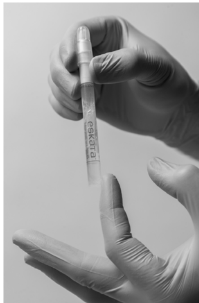
Step 4: Holding the applicator with cap pointing up, tap the bottom of the applicator to separate the solution from the crushed ampule.